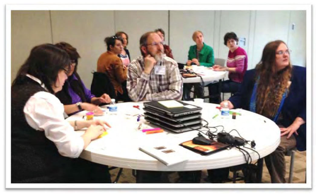
Coding in Libraries